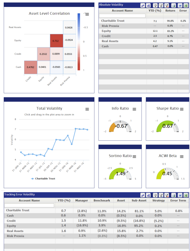
Sample VOR Dashboard